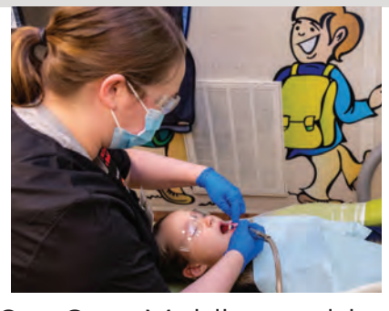
Our Care Mobile provided dental visits and health education information to 1,040 families , right in their communities.