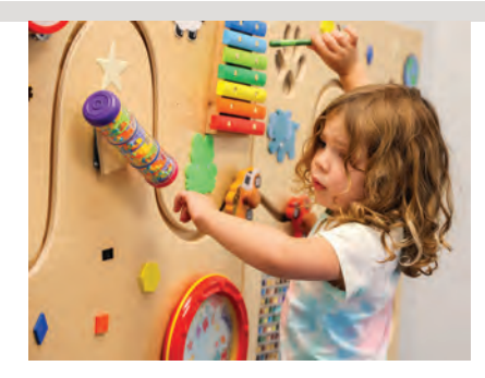
Our outpatient STAR Center served 288 children in just three months.